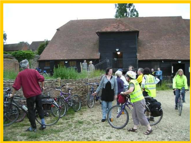
During National Bike Week in June the Godalming Cycle Campaign organised a well-attended evening ride to the barn.